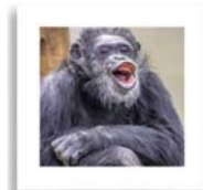
The coach giving his tactical lesson