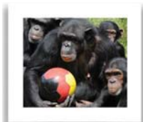
The coach calling the players for the tactical part (notice they use German ball).